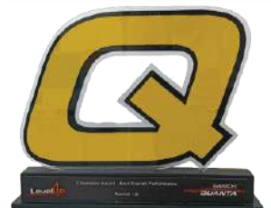
Champion Award Best Overall Performance Runnerup