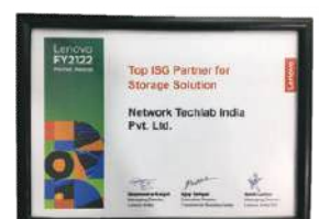
Top ISG Partner for Storage Solution