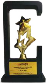
Accops Recognition for Extraordinary Efforts