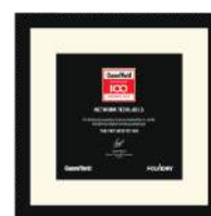
The Futuristic 100 Award IDG