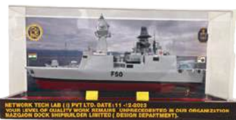
Award from Ministry of Defence for designing & implementing Data Center Project at Mazgaon Dockyard Ltd