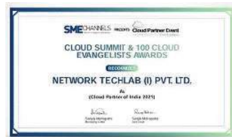
Cloud Partner of the Year