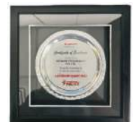
Canon Leadership Summit Certificate 2023