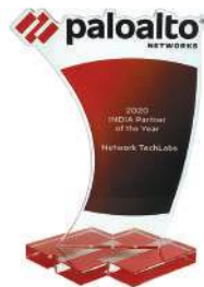
India Partner of the Year 2020 (Paloalto)