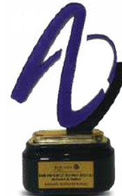
Alcatel SMB Partner of the Year 2022