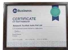
Authorized growth partner for Jio Business