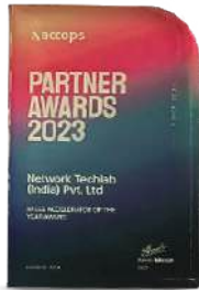
Accops Sales Accelerator Of The Year