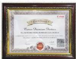
Canon Premium Partner Certificate