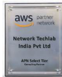
APN Select Tier Consulting Partner 2020 (AWS)