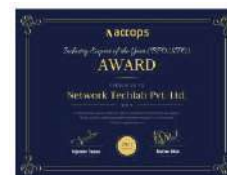
Accops Industry Expert of the Year