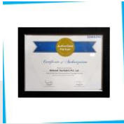
Authorized Partner 2019 (Samsung)