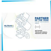
Partner of the Year NET NEW BUSINESS INDIA 2020 (Nutanix)