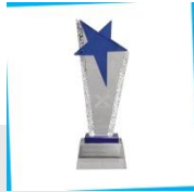
Partner Of The Year (Net New Acquisition) Nutanix Partnership Bootcamp 2019 (Nutanix)