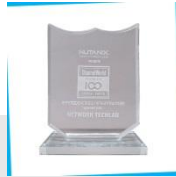
Channel World Premier 100 Special Award Hyperconverged Infrastructure 2019 (Nutanix)