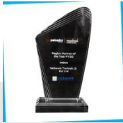
India Partner of the Year JAPAC PKO Transform Together 2020 (Paloalto)