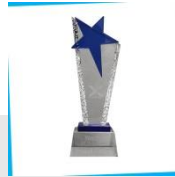
Warrior Of The Year Nutanix Partnership Bootcamp 2019 (Nutanix)