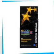
ISODA TechSummit 10X Baku Best Innovations Partners 2020 (ISODA)