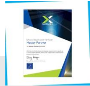
Nutanix is proud to award The title of master partner 2019 (Nutanix)