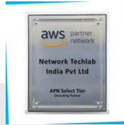
APN Select Tier Consulting Partner 2020 (AWS)