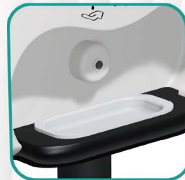
Plastic Drip Trays