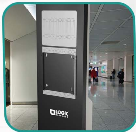
Back View Metal Housing