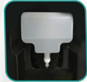
Internal Auto Dispenser