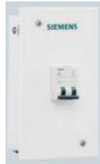
Single Door DB