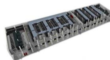
Turnkey Data Centers

Telecom Data Center/Collocation/Hosting Construction and Engineering.