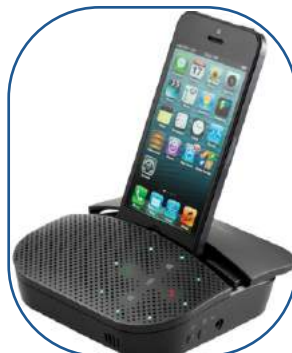
Logitech Mobile speaker phone - P710e