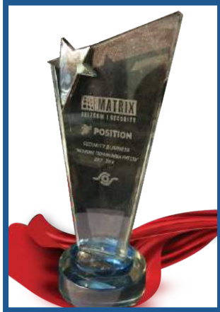
Matrix Telecom | Security 2 nd Position Security Business

We at Network Techlab (I) Pvt. Ltd. have always looked to push the envelope for providing our clientele with the best services and solutions. And that effort, hard-work and dedication has not gone unnoticed. Below are a few tokens of appreciations that have been showered on us by our clients.