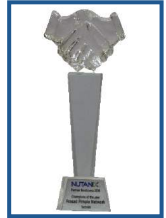
Nutanix Partner Bootcamp 2018 Champions Of The Year