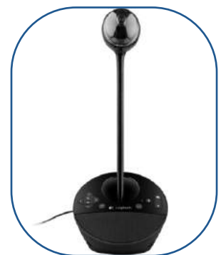
Logitech Conference Cam BCC950