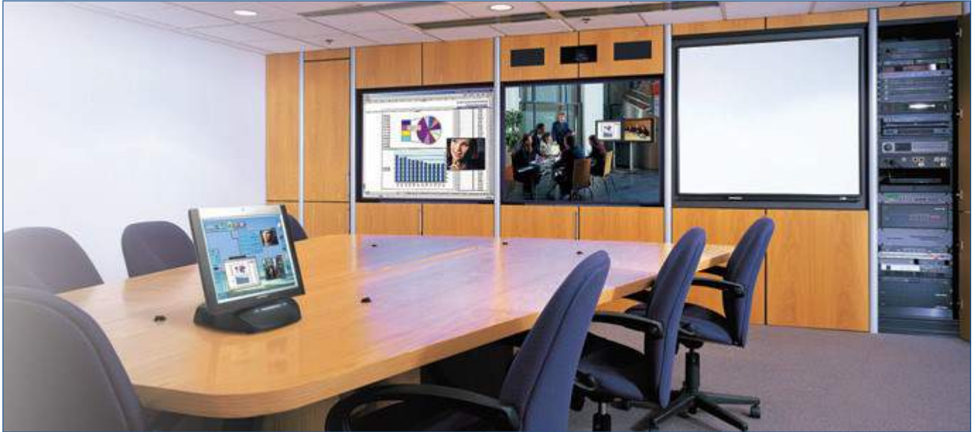
For small group meetings

We the keen eye on improving the ease of access of video conferencing NTIPL is proud to announce its latest collaboration with Logitech and introduce our clients to the latest cutting edge technology products which will ease the Hassles.