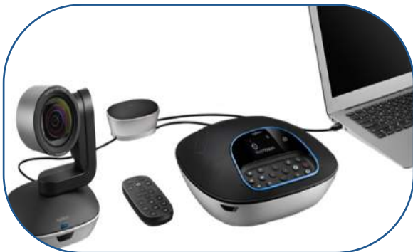
Logitech Conference Cam BCC950

With emergence of new trends in conference technologies we are providing latest tools and methods for you stay ahead of the curve.