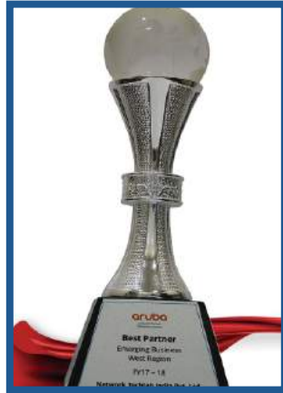
Aruba Best Partner Fy17 - 18 Emerging Business West region